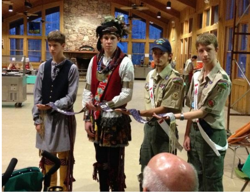
2013 Lodge/ Chapter Officer Oath